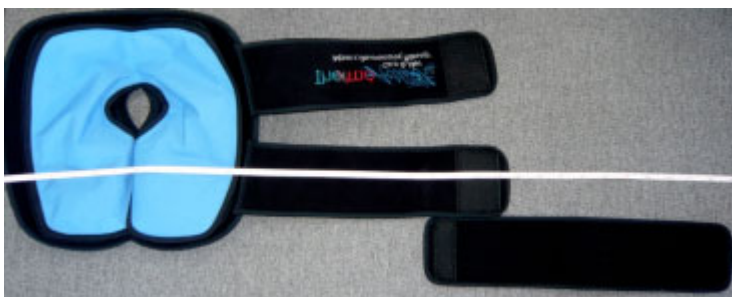
Open Knee Support with 1 extension strap ready to be attached

PolyGel has found a simple solution and, yet, another way to differentiate our ThermoActive product line from others on the market. We have created simple Velcro® compatible extension straps that will now be included with those ThermoActive models where the straps are applicable.