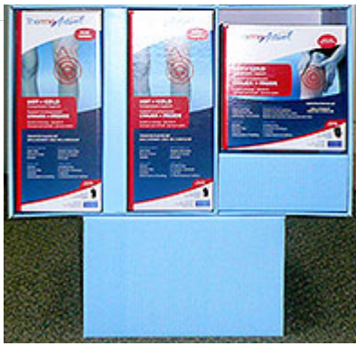
Shoppers Drug Mart in Canada Selling Thermoactive at Retail Stores

If you are interested in bringing in a display into your facility as part of the test, please contact Polygel at 973-884-8995 or at info@thermoactive.net .